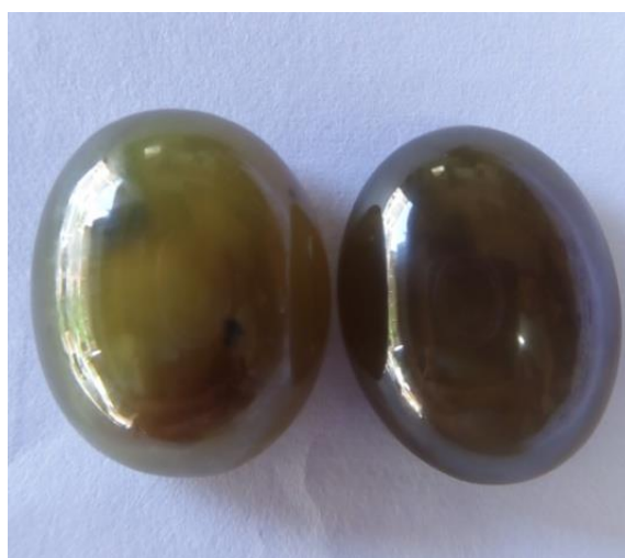
Figure 1. Bio-solar gemstone from Nagan Raya, Aceh

from the region of Aceh in Indonesia as jadeite, nephrite, serpentine, and vesuvianite based on their colors and hardness (Nurul et al. , 2014). They suggested that the colors and hardness of the gemstones were influenced by impurity mineral compounds (Nurul et al. , 2014). One of a well-known gem from the province of Aceh is called bio-solar. It is so beautiful, as shown in Figure 1. Its color is dark yellow. A recent study showed that this bio-solar gemstone contains 59.8% of CaO, 19.7% of SiO 2 , 11.1% of Fe 2 O 3 , 7.5% of Al 2 O 3 , and 1.3% of NiO. Based on its chemical composition, the bio-solar gemstone from Aceh can be classified as a type of vesuvianite jade (Akmal et al. , 2016). However, detail information of this gemstone, such as crystallinity, specific gravity, and hardness, is still unknown. According to the previous study, the vesuvianite gemstone is crystallite, having the tetragonal atomic structure (Anthony et al. , 2010). Its values of specific gravity and hardness are in the range 3.32 – 3.43 and 6 – 7 Mohs, respectively (Anthony et al. , 2010). The objectives of this study are to understand the chemical composition, crystallinity, specific gravity, and hardness of the bio-solar gemstone. The results are presented in this paper.